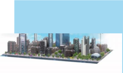
Physical World (Reality)

Capture the 3D object or environment in which the AR experience will be delivered