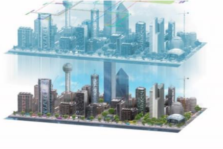
Physical World (Reality) and its digital version (copy) with features

Capture the 3D object or environment in which the AR experience will be delivered